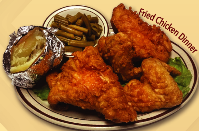
Fried Chicken Dinner