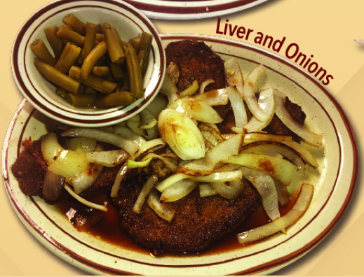
Liver and Onions