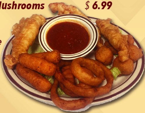
LaSalle Plate Appetizers